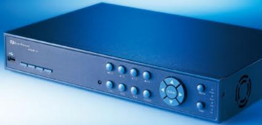
ECOR without DVD burner

Cost-effective and Powerful Feature Sets